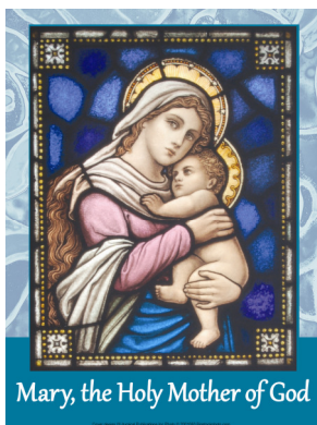
Mary, the Holy Mother of God

There is a dual action on today's Gospel that is sometimes overlooked. The shepherds find the infant in the manger as has been told to them by the angel. And then they go out to tell others about the child. In the meantime, Mary reflects on all these things in her heart. These are the two complementary stances of the Christian: action and reflection. Both are needed for a balanced spiritual life. It is, in effect, putting into practice the two great commandments: love God and love your neighbor.